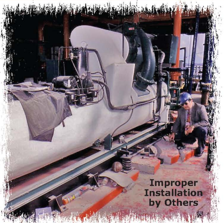
Improper Installation by Others

Click Here to View a Complete Pictorial Study of Seismic Damage and Use of Proper Safeguards.